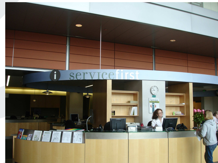
Bellevue Government Hall, USA